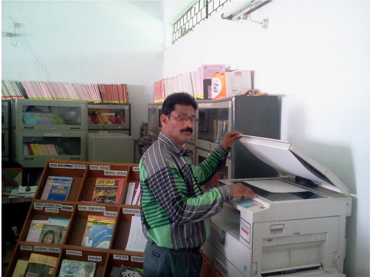
Library:- Xerox Facility.