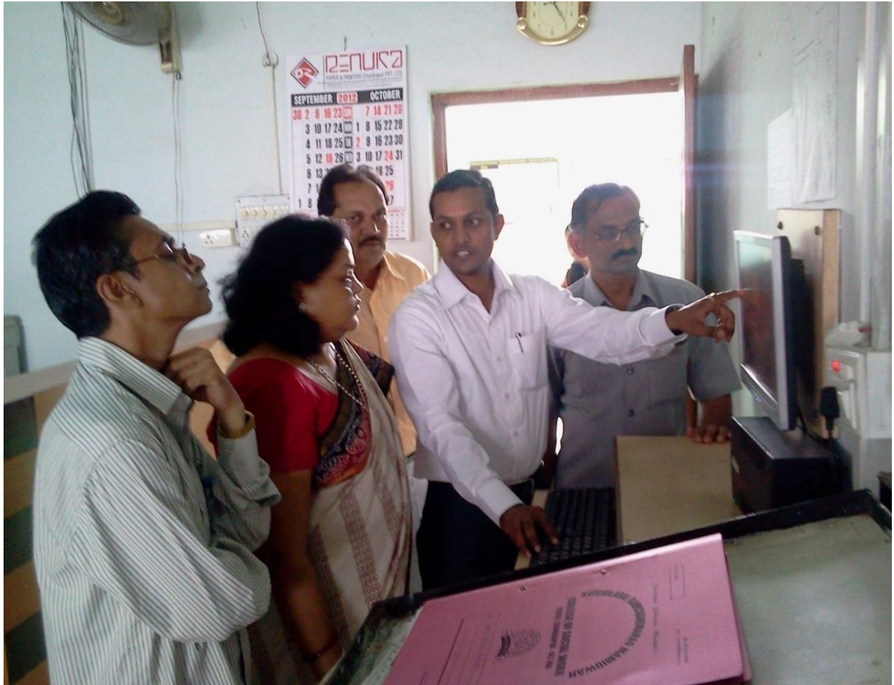
Library:- OPAC Training for Teaching Staff