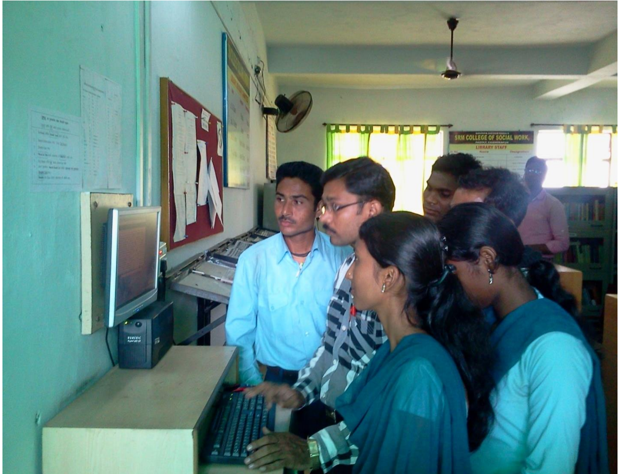
Library:- OPAC Training for Students