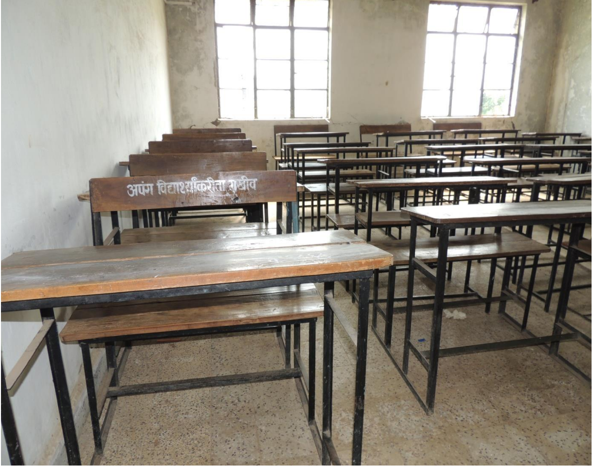
Reserved for Divyaang Students