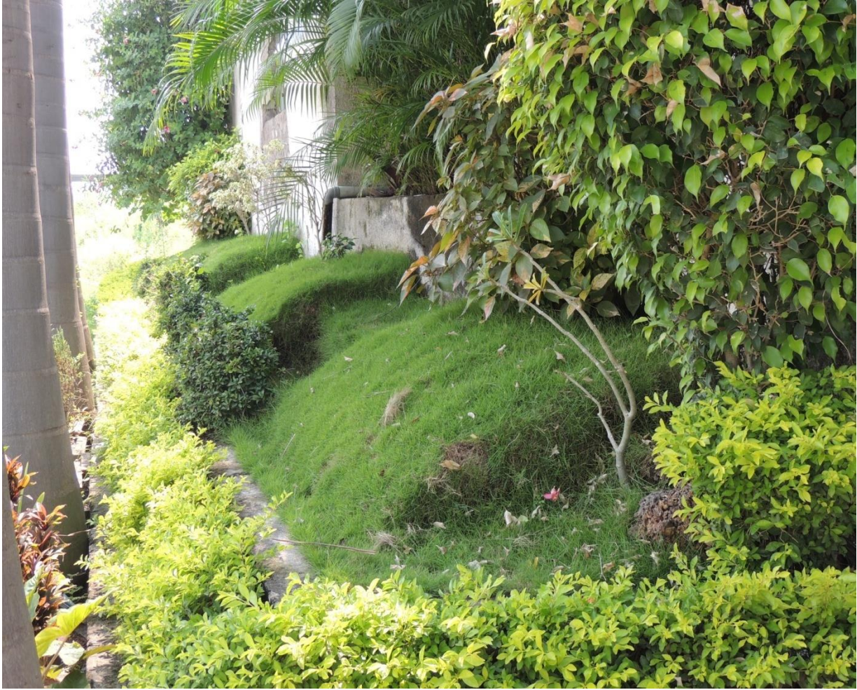
Landscape around building