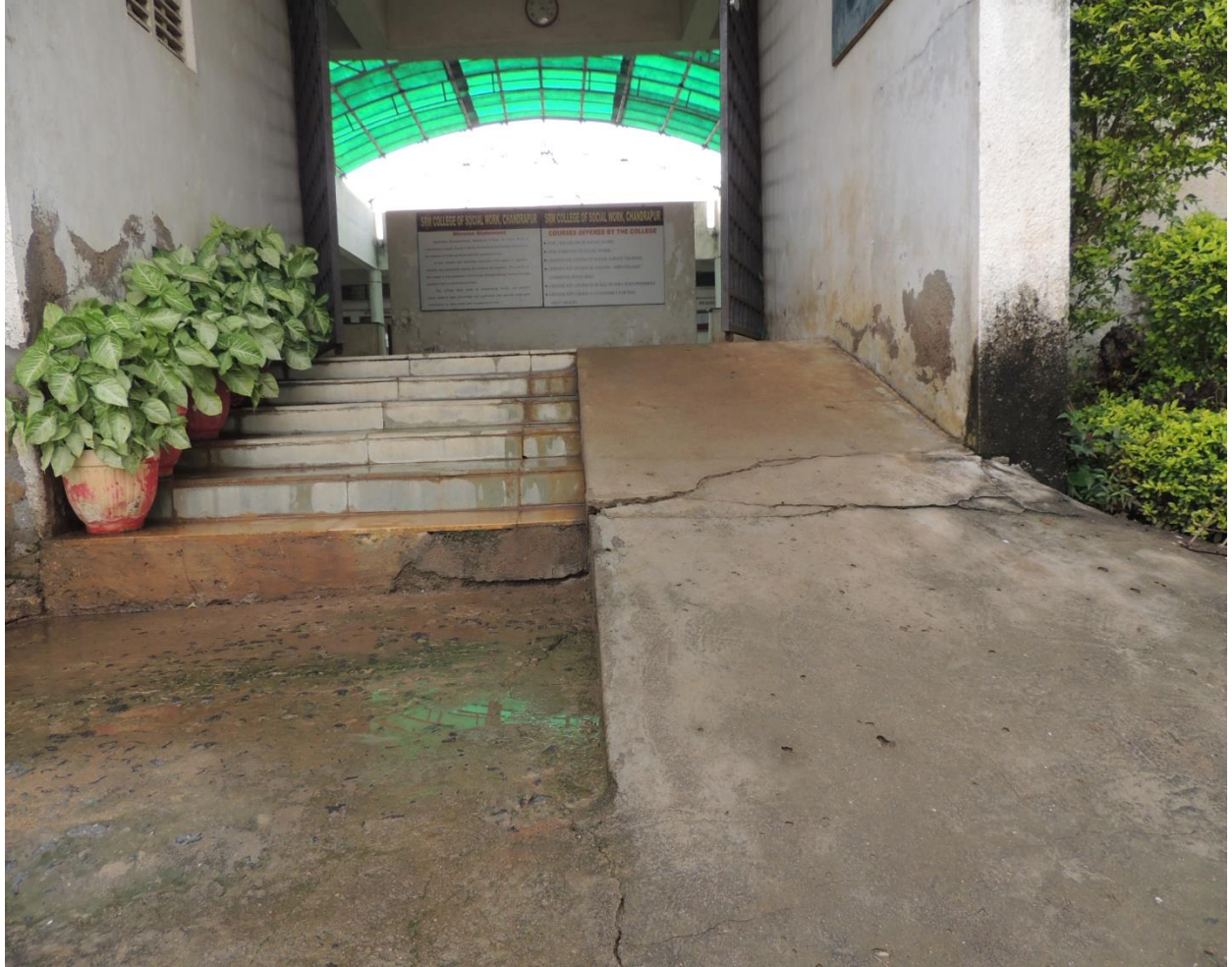
Ramp for Divyaang Students