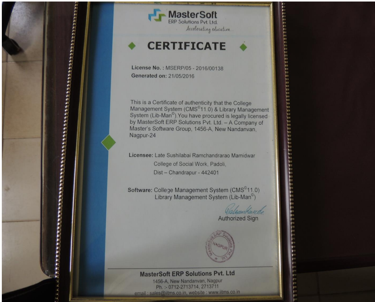
Legal Licensed Software Certificate