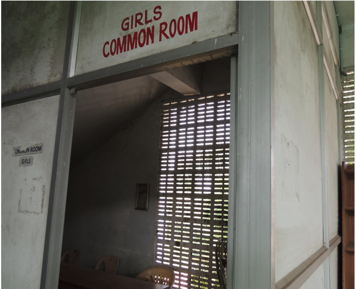
Girls Common Room