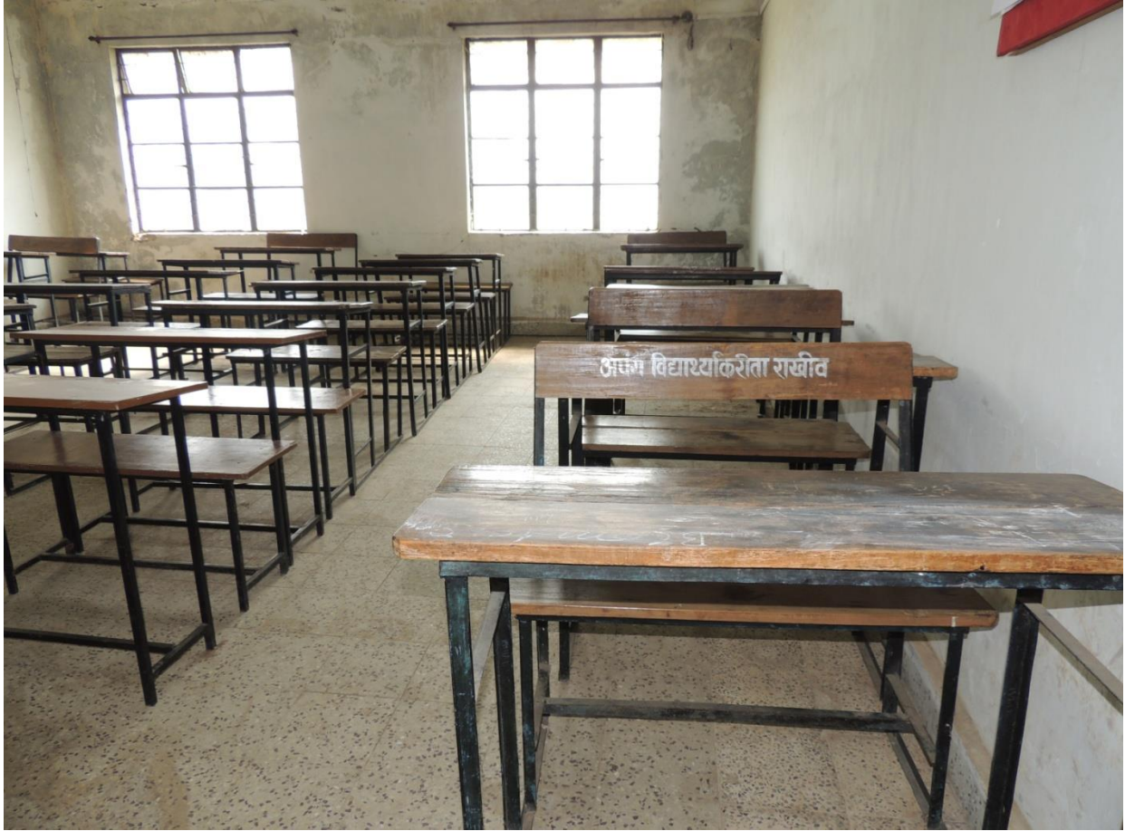
Arrangements for Divyaang Students