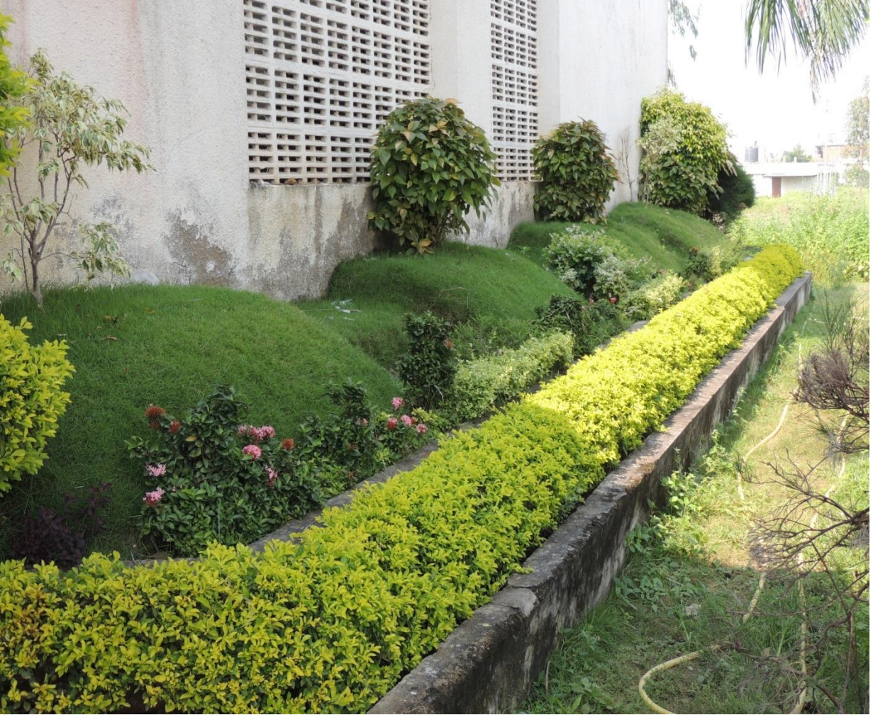
Landscape around College